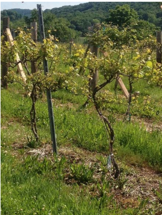
Spur pruned Hudson River Umbrella.

Results: Judicious pruning on the spur trained vines partially compensated for the bud loss and spur pruned vines still produced a reasonable crop. However, this was not possible on cane pruned vines resulting in less fruiting nodes and clusters per foot of row. Thus, cane pruned vines tended to have less yield (Table 1). The productivity of the GDC and SD trained vines was roughly twice as much as the analogous single canopy treatments (Table 1).